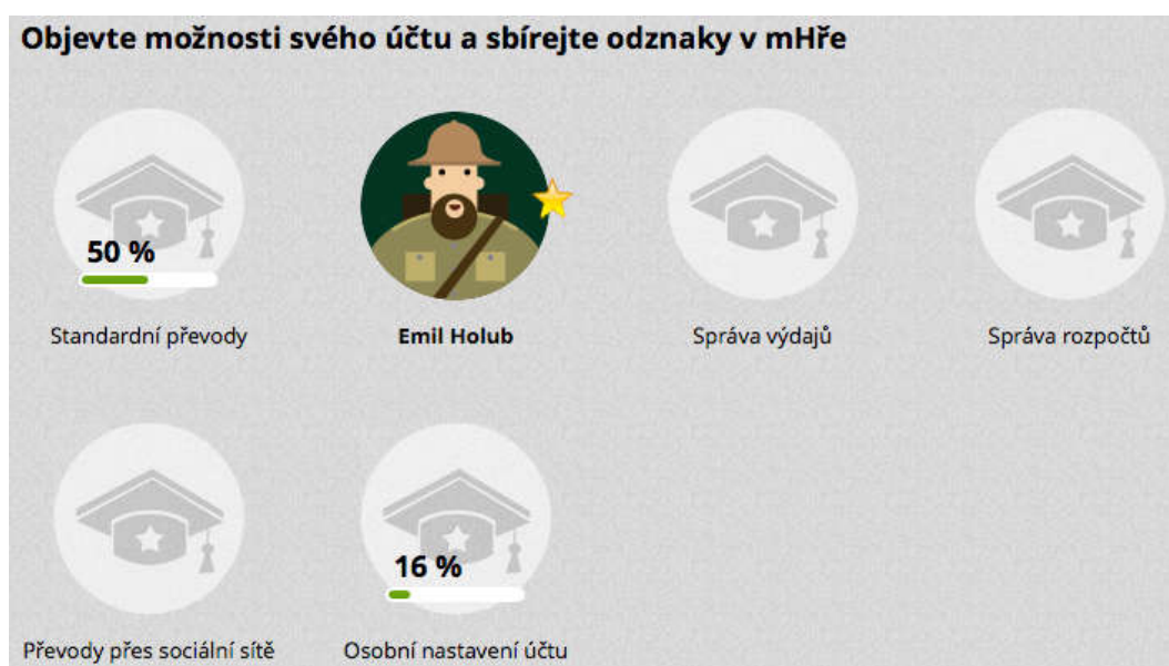
Fig. 1: The Internet Banking Gamification

Previous example shows us one of many gamification principles. We are part of gamified environments every day even though we might not realize it. However, the study of gamification and its mechanics is not a new phenomenon. It has found its place across many professional fields e.g. marketing or sales. Sometimes the gamified elements are hidden but usually they are visible at first sight. More frequently we have just accepted them naturally as a part of certain environment. These elements can easily take a lot of different forms. In the example we use benefit points, but we could also imagine customer vouchers, discounts, badges, various little gifts etc. We tend to no more distinguish between those. As a counterpart are visible elements. In the Fig there is shown the use of gamification in the internet banking information system.